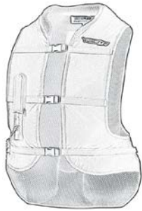
Airnest or Turtle