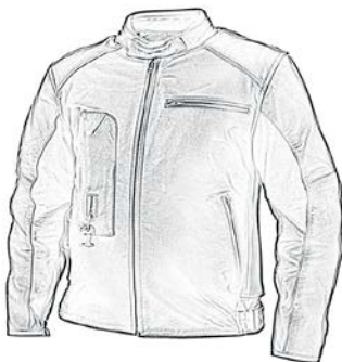
Roadster or Xena (leather)